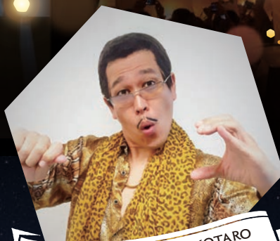
Special Performance by PIKOTARO

Venue: Tokyo Metropolitan Government Building Citizen's Plaza (2-8-1 Nishi-Shinjuku, Shinjuku-ku, Tokyo)