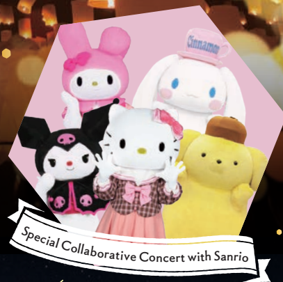
Special Collaborative Concert with Sanrio